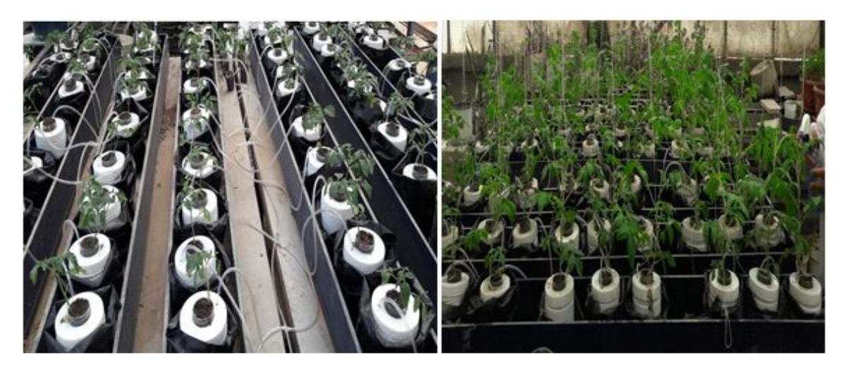
General photos for hydroponic experience.

treatment, and the Hoagland solution was changed weekly with the original content in the experiment and with the same salt concentration for the primary treatments. Spraying the different treatments was done once every week from the start of the experiment for four weeks. The experiment lasted for 6 weeks, growth parameters were recorded for plants (shoot fresh weight (SFW), root fresh weight (RFW), shoot dry weight (SDW), root dry weight (RDW) and root/shoot ratio was calculated. Also, the percentage of moisture in the shoot and root system was calculated as follows: